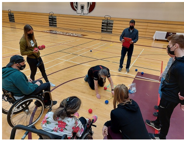
Photo from our 2022 Bocci "Try it" session